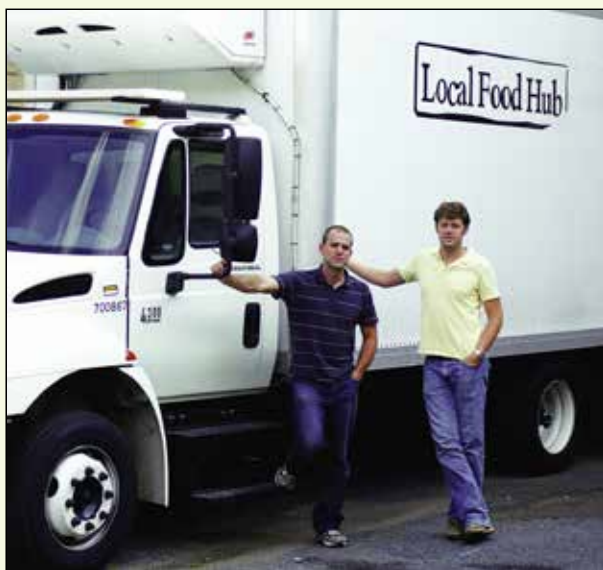
The coordination services a food hub provides can extend the season of products. Larger crop volume and coordination of production can ensure a steady flow of product that helps to stabilize prices.

Even in their short history, food hubs have proven highly adaptable — in size, scope and type of products offered — to meet the vagaries of consumer demand. Indeed, the term “food hub” exists more as a description of a number of functions than as a defined business structure. Thus, the term “food hub” is often applied to a continuously changing business model, transforming to satisfy the ever-changing demands of local consumers. This continuous adaptation has resulted in an increased focus on the social-mission aspects of many food hubs and their community interactions, as well as a movement to address