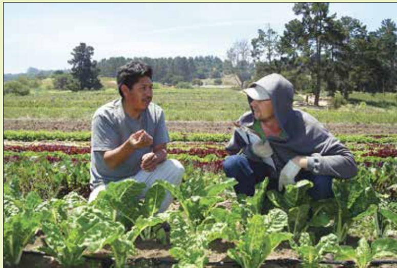
Food hubs can negotiate better prices for their producers, keeping more farmers in business and helping them expand production into new crops.

The User-Benefits Principle — Since the cooperative is owned by its members, they have the opportunity to receive services otherwise not available, get quality supplies at the right time, have access to markets, or for other mutually beneficial reasons. ■