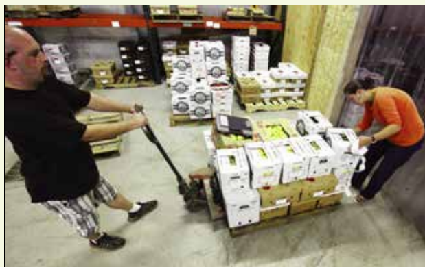
Increased profit for local producers and increased production can directly impact a community through the local retention of more food dollars.

various functions of the organization and receive benefits. Individual farmers and other producers are generally in the position of being price-takers. Food